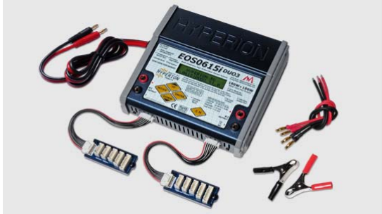
USB Cable also included but not pictured

v3.1 Firmware version. Visit http://media.hyperion.hk/dn/eos for the newest manuals, firmware, and software